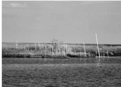
NRDA research site, Louisiana